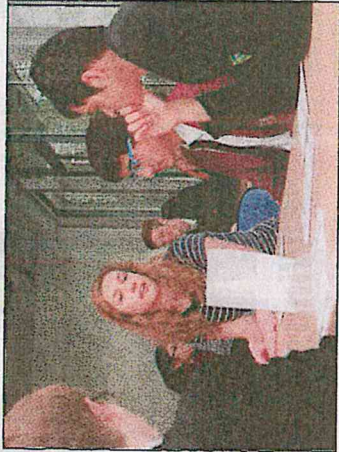
PLANNING AHEAD: Students were asked to consider careers in science, technology, engineering and maths. Ref:127648-12